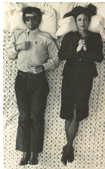
Holly Wright American, b. 1941

Final Portrait: Peggy , 1981 Gelatin silver print on canvas, 75 x 34 1/2 in. (190.5 x 87.6 cm). On loan to The Fralin Museum of Art at the University of Virginia from the artist, IL.2024.5.1. © Holly Wright