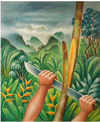
Miguel Covarrubias Mexican, 1904–1957

Fever Bark Tree , circa 1946 Gouache on paper, 16 x 20 in. (40.6 x 50.8 cm). Collection of The Fralin Museum of Art at the University of Virginia. Gift of Frederick and Lucy S. Herman Foundation, 2018.5.31. © Miguel Covarrubias