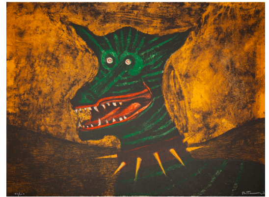
Rufino Tamayo Mexican, 1899–1991