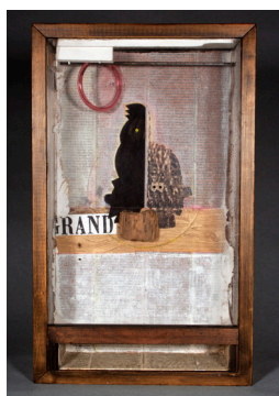
Joseph Cornell American, 1903–1972 Untitled (Juan Gris Series, Black Cockatoo Silhouette),

ca. 1959–60 Box construction 19 5/8 x 12 x 4 3/8 in. Gift of The Joseph and Robert Cornell Memorial Foundation, 2002.15.3 Fralin Museum of Art at the University of Virginia