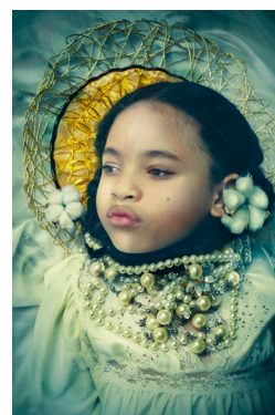
Tokie Rome-Taylor American, b. 1977 Ancestors Speak... Soft as Cotton, 2020

Color polymer photogravure on paper 58 1/4 x 40 1/4 in. Museum purchase with the Curriculum Support Fund, 1997.31.11 Fralin Museum of Art at the University of Virginia © Eeva-Liisa Isomaa/Artists Rights Society (ARS), New York