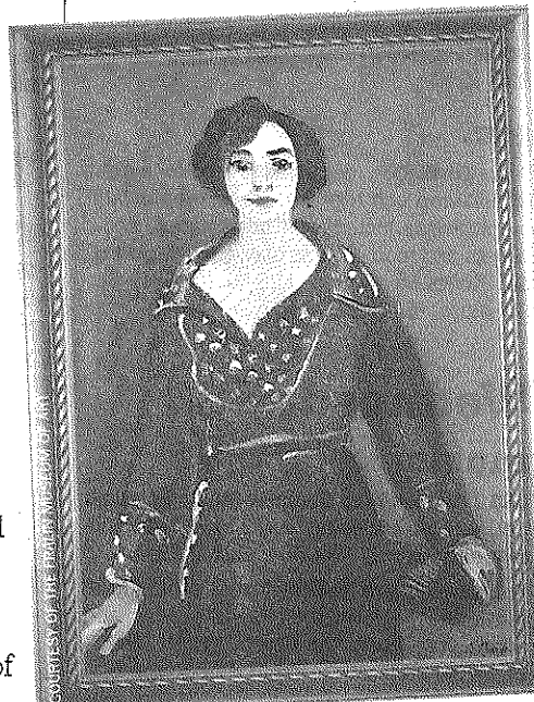
"Émilie Charmy and the Feminine in Modern French Art" runs through Sunday at the Fralin Museum of Art.

French novelist Roland Dorgelès wrote, " Émilie Charmy , it would appear, sees like a woman and paints like a man; from the one she takes grace and from the other strength, and this is what makes her such a strange and powerful painter who holds our attention." Remembered in part for her place in the early avant-garde movement, Charmy produced a body of work full of...the body. Her sensuous, expressive portraits of the female form have re- mained objects of admiration, and are displayed alongside work by contemporaries Dufy, Matisse, Rouault, and Valadon. Free, Tuesday-Sunday, noon- 5pm. UVA's Fralin Museum of Art, 155 Rugby Rd. 924-3592.