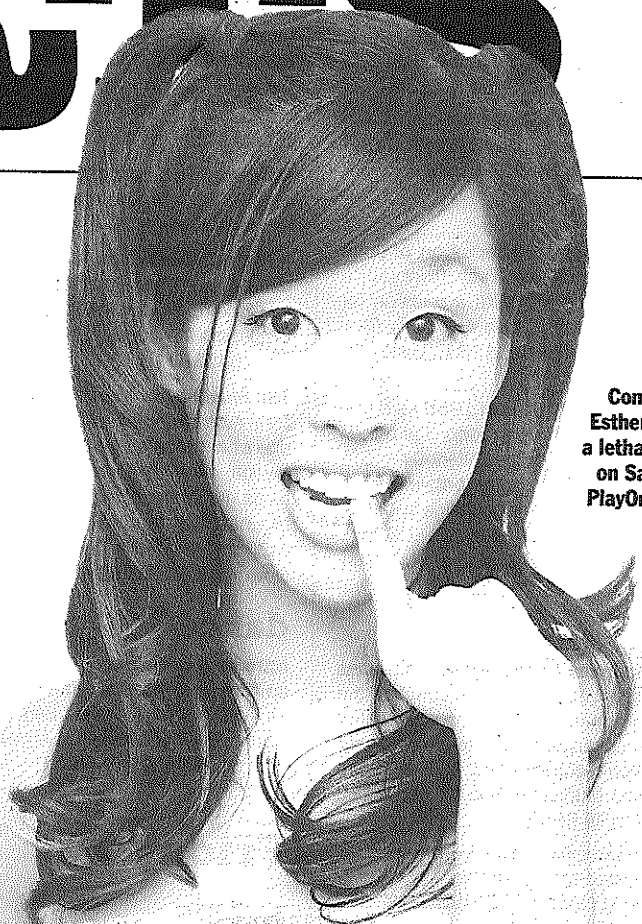
Comedienne Esther Ku packs a lethal punchline on Saturday at PlayOn! Theatre.

Follow our Twitter feed, @artscville, for an amplified look at the local arts scene.