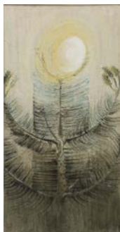
Morris Graves American, 1910-2001