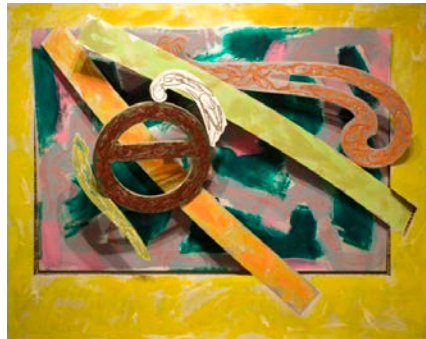
Frank Stella American, b. 1936

© 2017 The Isamu Noguchi Foundation and Garden Museum, New York / Artists Rights Society (ARS), New York