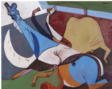
Romare Bearden American, 1911-1988

Collection Neuberger Museum of Art, Purchase College, State University of New York Gift of Roy R. Neuberger, 1974.22.07 Art © Estate of Stuart Davis/Licensed by VAGA, New York, NY