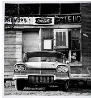
David Plowden American, b. 1932

© 2017 Frank Stella / Artist Rights Society (ARS), New York