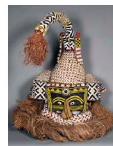
Unknown Congolese Artist Kuba Peoples, Democratic Republic of Congo, Africa

Royal Mukenga (Mwaash aMbooy) Mask , 20th century