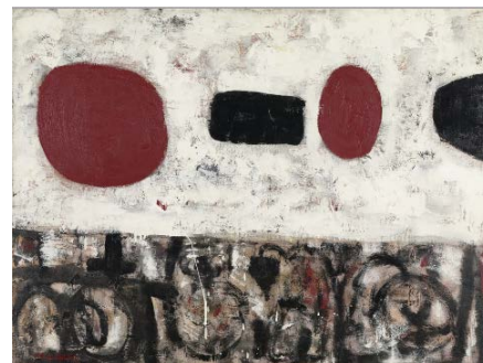
Adolph Gottlieb American, 1903-1974