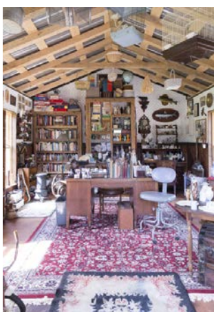
Mark Dion American, b. 1961