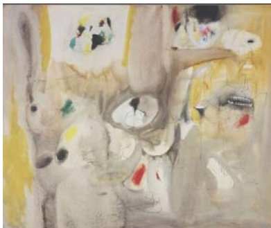
Arshile Gorky American, 1904-1948

The Museum of Modern Art, New York Purchase (by exchange), 138.1945