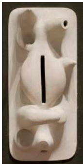
Isamu Noguchi American, 1904-1988

The Fralin Museum of Art at the University of Virginia Museum purchase with the aid of the 1984 Bayly Auction, 1984.39