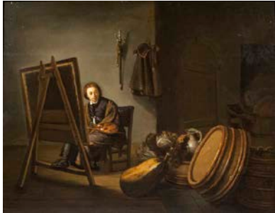
Pieter van den Bosch Dutch, ca. 1613 – ca. 1663